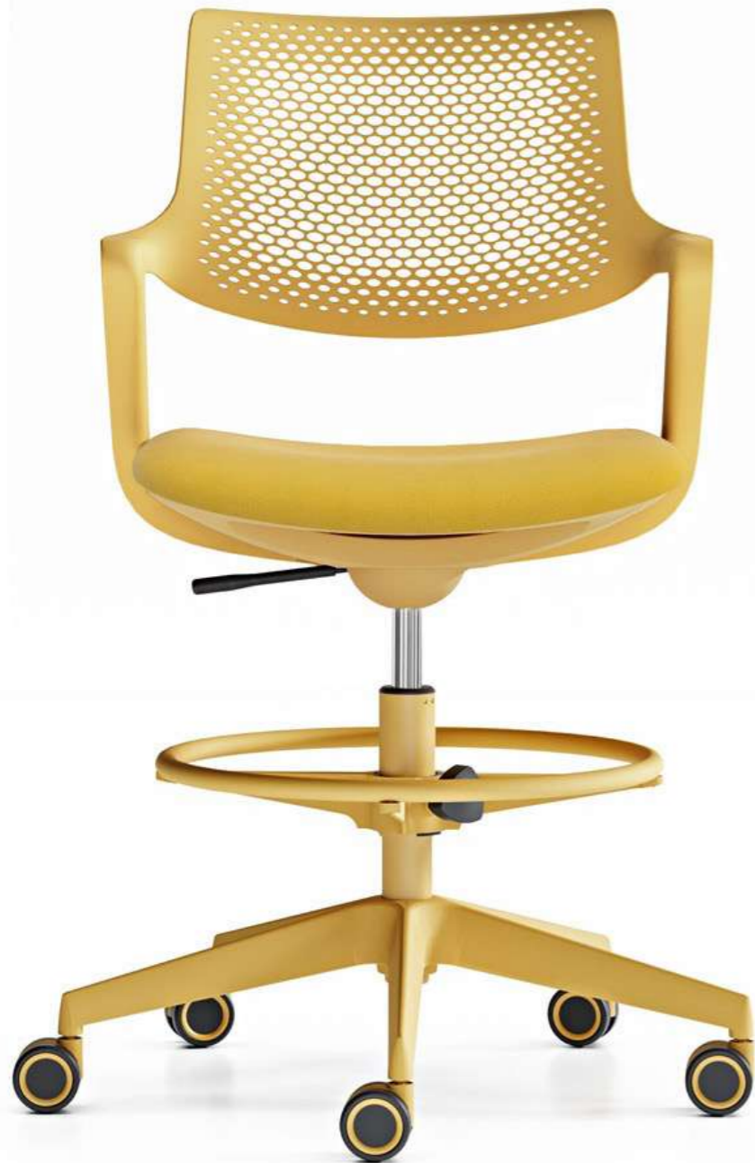
Molly high stool