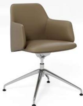
ORREN Executive / Conference