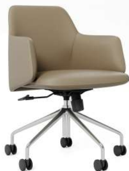
ORREN Executive / Conference